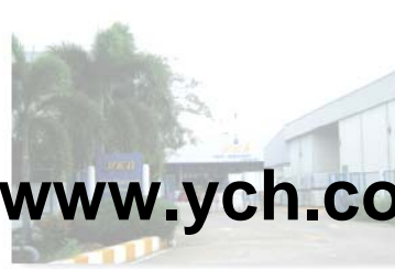
Bangkok (Lad Krabang), Thailand