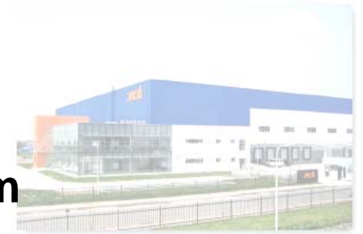
Tianjin (Airport Logistics Park), China