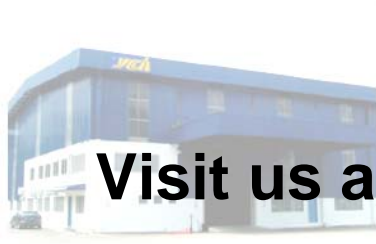
Kuala Lumpur (Shah Alam), Malaysia