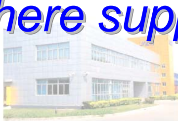
Tianjin (Free Trade Zone), China