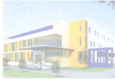
Chennai (Sriperumbudur), India