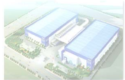
Shanghai (Lingang), China