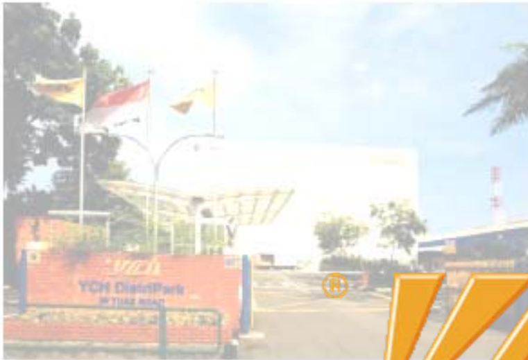
Corporate Headquarters, Singapore